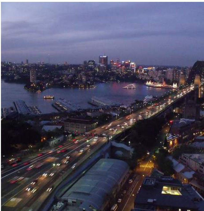
Roads, cars and taxes