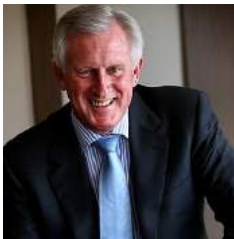
Dr John Hewson AM, Professor and Chair of TTPI