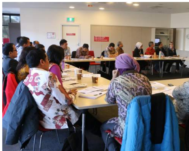
Indonesian Ministry of Finance Workshop