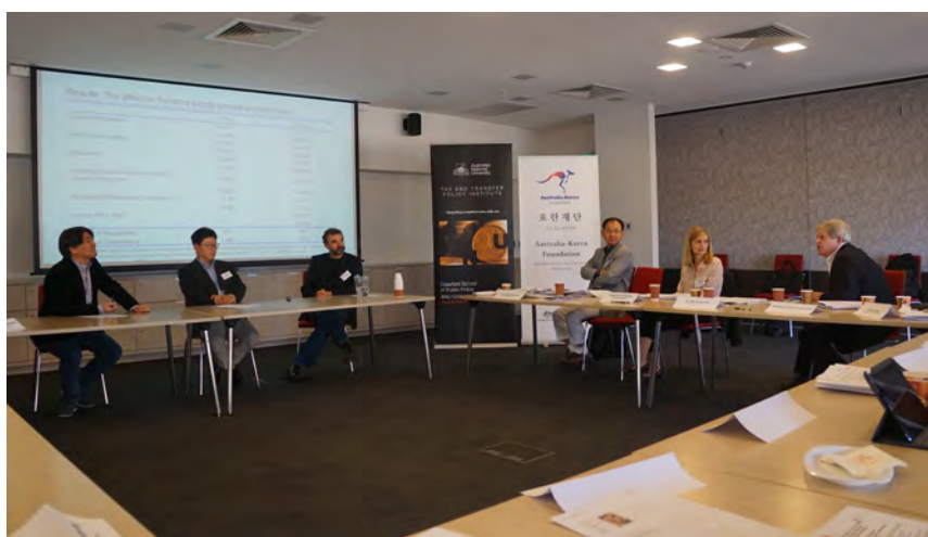
Australia and Korea workshop, 9-10 November 2017

This was the first of two workshops and public seminars held in 2017 (Canberra) and 2018 (Seoul).