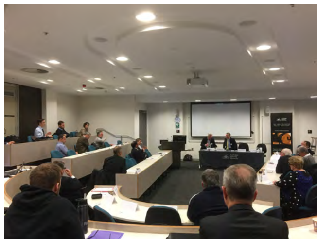
What shall we do with company tax? 24-25 July 2017