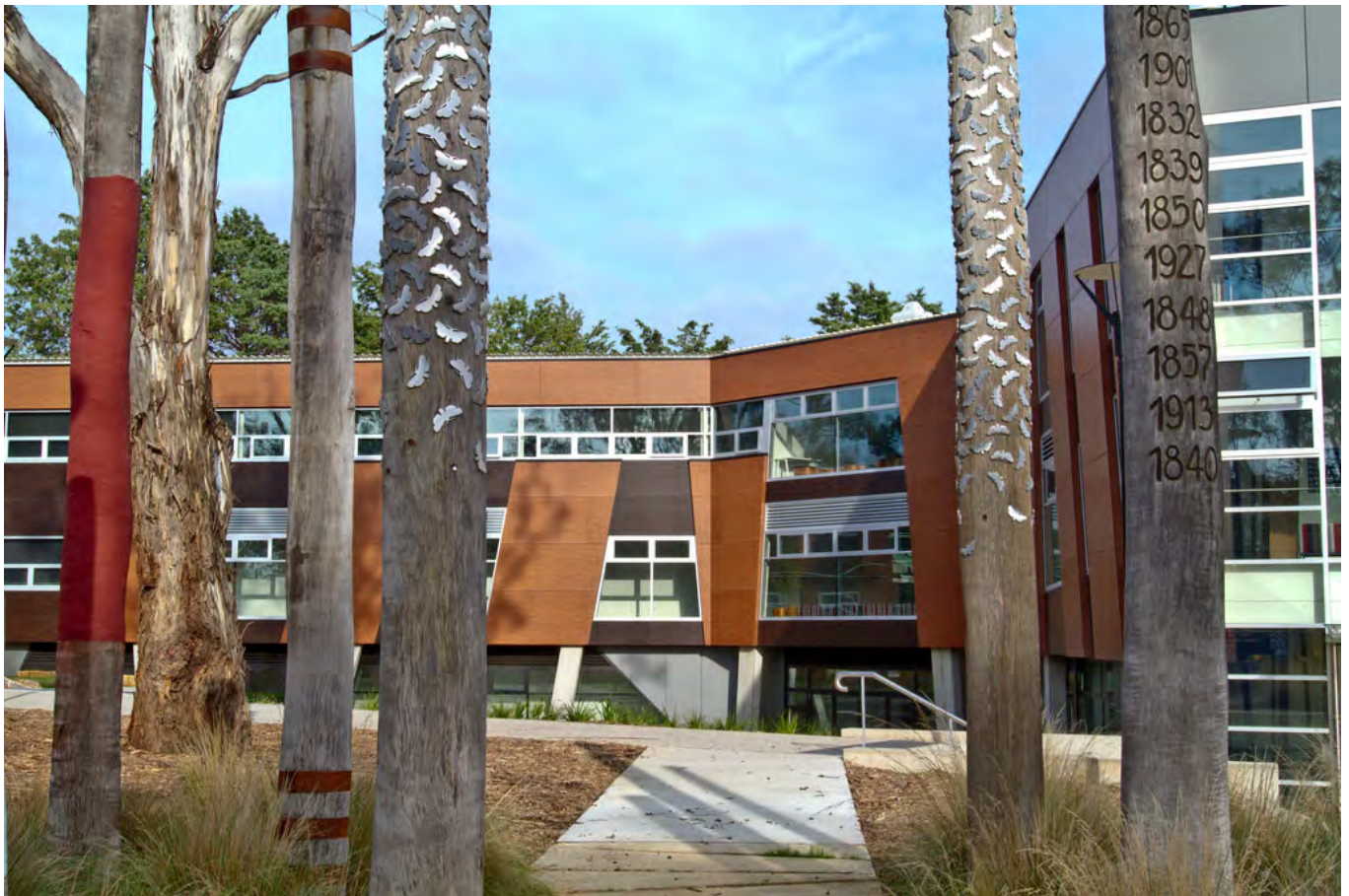
JG Crawford Building

In addition to the endowment funding and investment income, in 2017-2018 TTPI raised about $350,000 in external funding through Linkage and Discovery grants from the Australian Research Council, executive education and courses and commissioned research, as well as the Asia Pacific Innovation Program at the Australian National University, to fund specific activities or research projects.