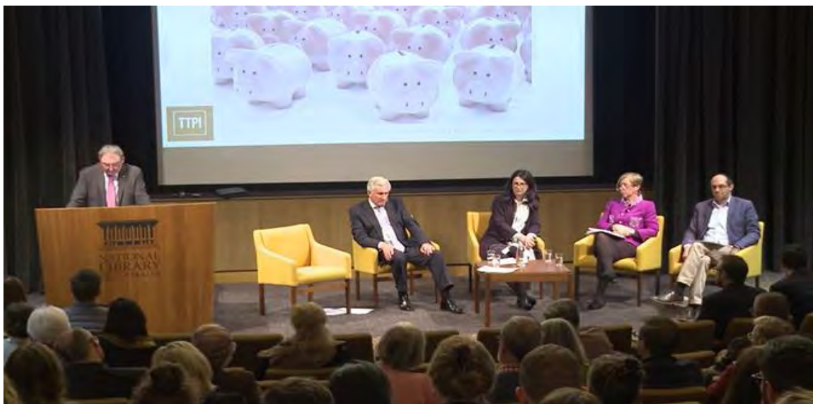
Post budget analysis, 2018-2019, National Library of Australia, 15 May 2018