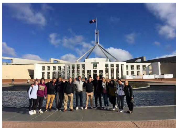
Indiana Bloomington College students

The visit was supported by the Australian National University - University of Indiana Exchange Program. The students learned about Australia's political system and federation, as well as tax policy and public finance from an international perspective. They combined their visit to ANU with visits to Australian government institutions in Canberra.